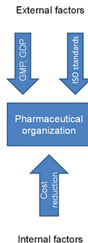
Figure 1: Pharmaceutical organization specificities in view of the IMS approach.

A model to analyse, harmonise, align and integrate specific standard requirements.